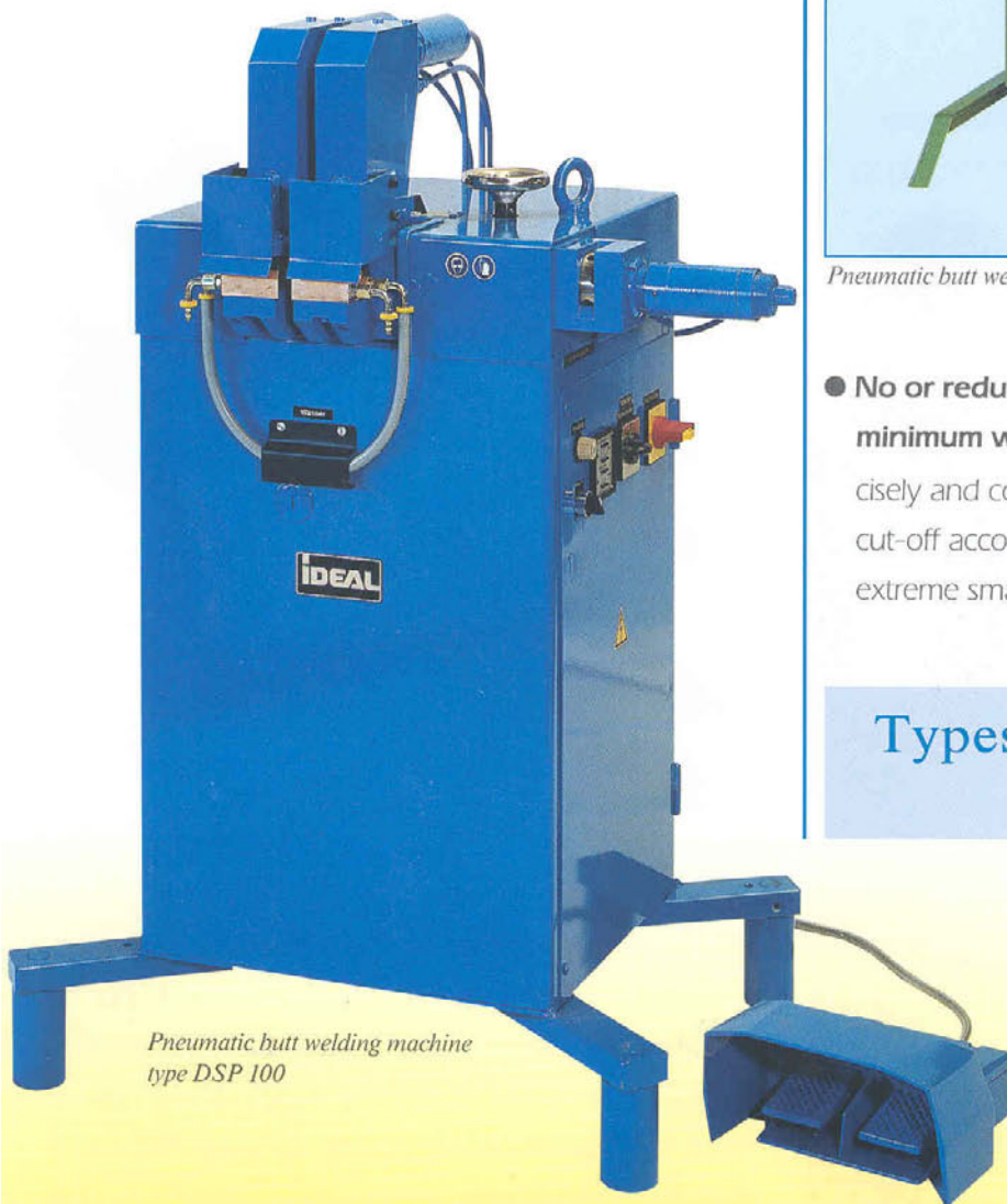
Pneumatic butt welding machine type DSP 100

Types DSP 080 - DSP 140, DST 100/DST 120