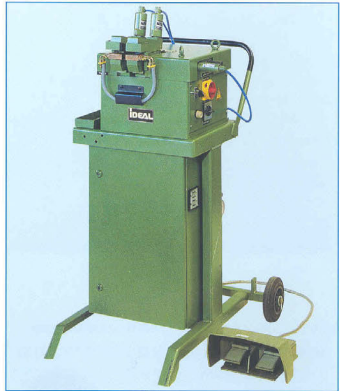
Pneumatic butt welding machine type DSP 080