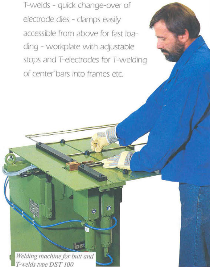
Welding machine for butt and T-welds type DST 100